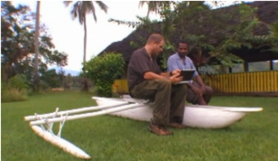
Josh Gates and Fabian in Salamaua, Papua New Guinea, in 2007