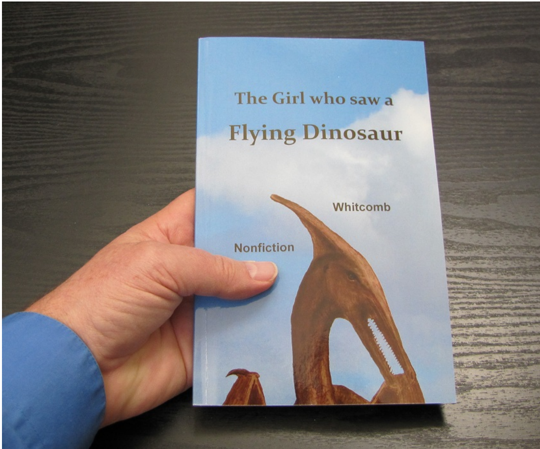
The Girl who saw a Flying Dinosaur (by Whitcomb)