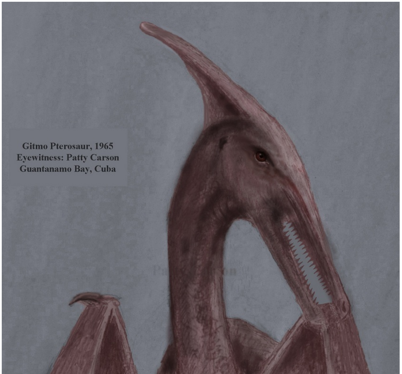
Sketch by the eyewitness Patty Carson: a flying creature seen in Eastern Cuba