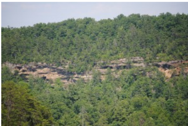
wilderness forest in Kentucky

Why shouldn't Kentucky have accounts of modern pterosaurs? States all around Kentucky have had their own accounts. The forests give modern pterosaurs many places to hide, too.